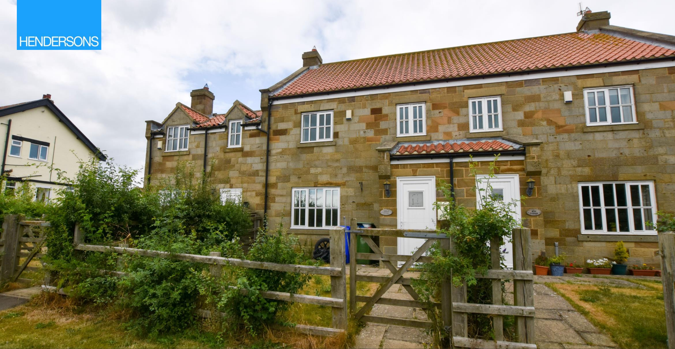
HOLLY COTTAGE, WHITBY Guide Price £295,000